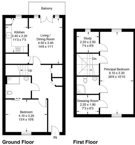
Illustration for identification purposes only, measurements are approximate, not to scale. Fourlabs.co © (ID1299116)