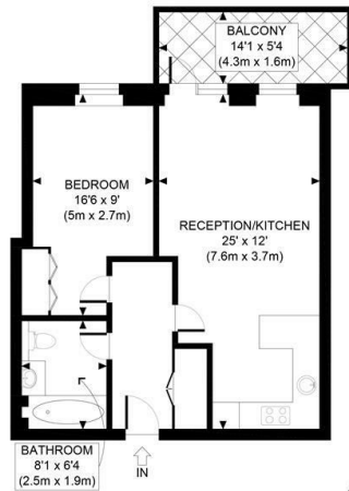
THIRD FLOOR GROSS INTERNAL FLOOR AREA 547 SQ FT